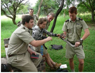
Snake handling at the Reptile park

The days and nights are very hot and humid. Excellent reptile weather! We only had three or four snakes around the rondavels and that is a good manageable average. Frogging in the evening at our dam proved to be a first for all the students and the noise these frogs make is eardeafening. In between all this we managed to visit our other Bushwise campus at Garonga and got to know the students there a little bit better. Soon we will go there again for a braai evening and socializing evening. The students first have to go through the Bushwise exams but are all keen to learn and study long hours. Even the students that are here for only 6 months are as motivated as the rest. This makes the job fun. Thanks guys! It was a good but busy start and the preparation by the Bushwise staff has paid off.