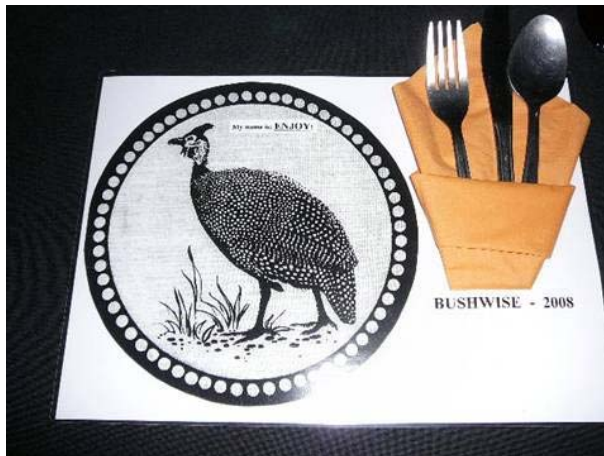
Table set-up at hosting practical

During the assessment gamedrive other students would prepare a hosting diner and evening for the students coming back from drive. One group raided their family cupboard back home for this and nice table ornaments suddenly popped up on the table. The other group decided to combine the diner with African bush stories. Awesome!